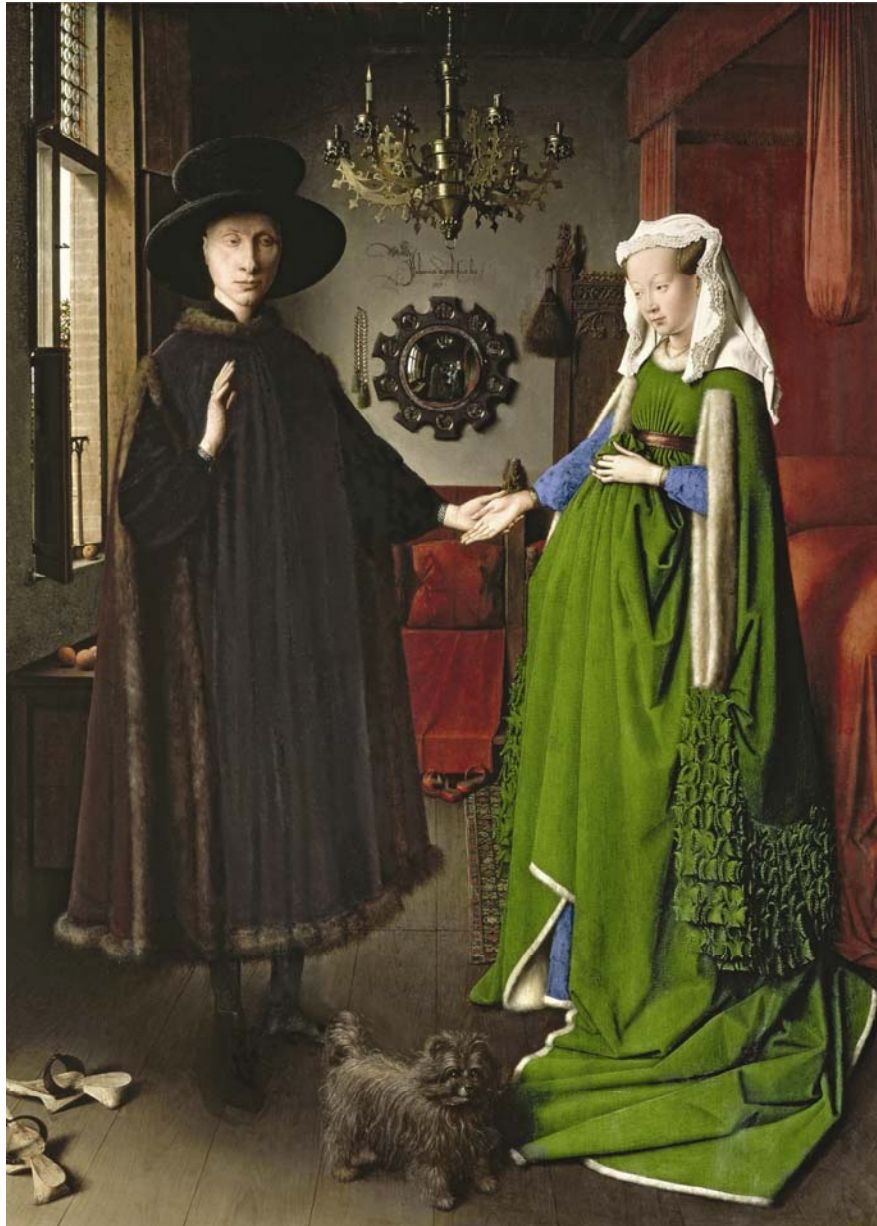
National Gallery, London, UK / The Bridgeman Art Library