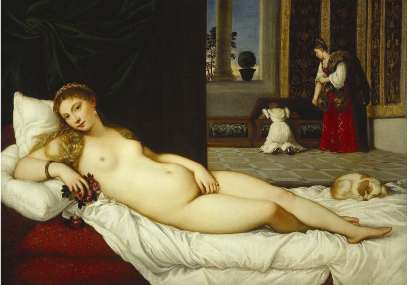
Scala / Ministero per i Beni e le Attività culturali / Art Resource, NY